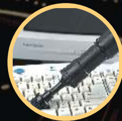
COMPUTER CLEANER Maintain your computers and delicate electronic items.