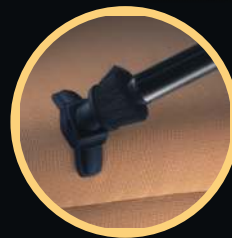
ALL SURFACE CLEANER Clean hard surfaces like walls/furniture as well as upholstery with the multiple purpose wonder.