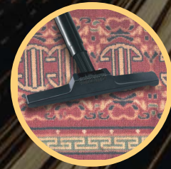
CARPET BRUSH Clean your carpets thoroughly without affecting the delicate fibres.