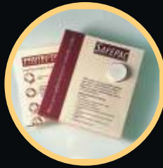
VACUUMIZED SAFEPAC Vacuum seal and store valuables safely forever and also save space.