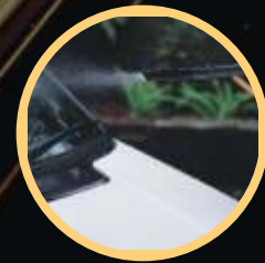
CAR WASH ADAPTER Do a quick cleaning of car exteriors right at home.

Available exclusively through the trained Direct Sales Specialist of Eureka Forbes