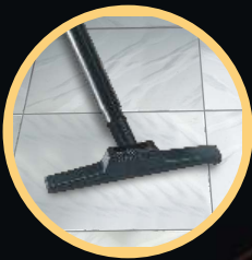
FLOOR BRUSH Clean your floors and also bring back their lustre.