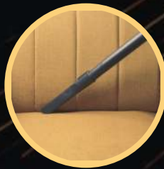
CORNER CLEANER Reach corners, crevices and other hideouts of dust. Use it also for car cleaning.