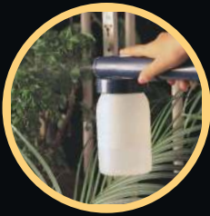
SPRAY JAR Water plants, spray paint, pest control or wet-blow-clean nets with this wonder.