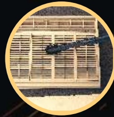
GRILL CLEANER Remove caked dust from blinds, grills and Acs.