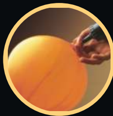
PRECISION CLEANER Use it to suck in dust from tiny areas as well as to blow balloons for the next party at home.