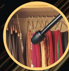
AROMISER Fumigate or freshen clothes and home.